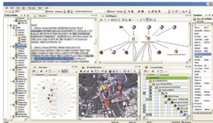
Your foundation for multiple applications ... Ready Now!

Our Viper™ software integration platform seamlessly integrates diverse applications, services and data sources into a unified collaborative system. Viper enables a collaborative work environment, allowing analysts to seamlessly work together from multiple workstations. The framework creates an integrated suite of analysis tools, allowing operational ease of use with minimal training.