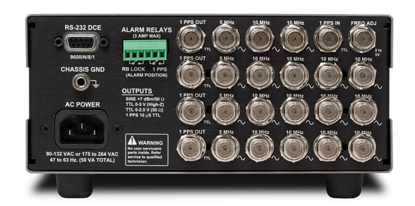
FS725 rear panel (with Opt. 03)

FS725 Benchtop Rb frequency standard $2795 Option 01 Distribution amplifier (6 outputs) $495 Option 02 Distribution amplifier (12 outputs) $995 Option 03 Distribution amplifier (18 outputs) $1495 O725RMD Double rack mount kit $100 O725RMS Single rack mount kit $100