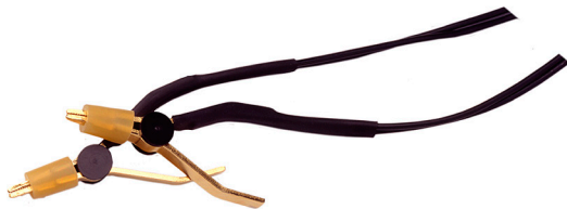
SR726 Kelvin Clips

The SR715 and SR720 support three types of binning schemes: pass/fail, overlapping and sequential. Pass/fail has only two bins: good parts and everything else. Overlapping (or nested) bins have one nominal value and are sorted into