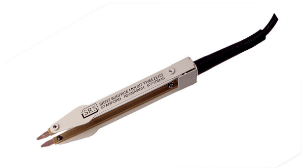
SR727 Surface Mount Tweezers

Two rear-panel input connections are provided for an external bias voltage. Voltages as high as 40 VDC can be used. An optional handler interface provides control lines to a component handler for sorting. A standard RS-232 interface allows complete control of all instrument functions by a remote computer. A GPIB interface is included with the handler option.