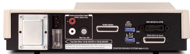
SR720 rear panel

Two rear-panel input connections are provided for an external bias voltage. Voltages as high as 40 VDC can be used. An optional handler interface provides control lines to a component handler for sorting. A standard RS-232 interface allows complete control of all instrument functions by a remote computer. A GPIB interface is included with the handler option.