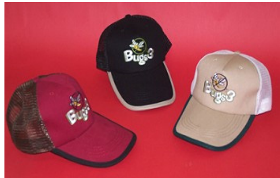
(assorted color and hat style)

A miniature sonic wave generator is installed to the bottom side of the curve shape hat brim. This sonic wave imitates the wing speed of male mosquito to repel the pregnancy female mosquito who is the only one bite.