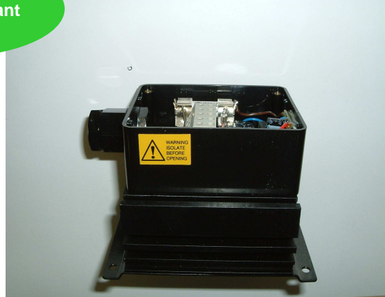
Photo shows complete unit with open lid