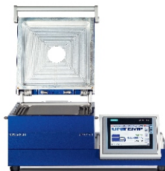
RVS-210 front view open chamber