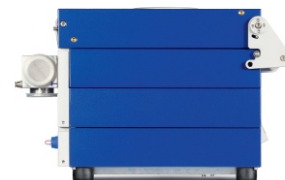
RVS-210 side view closed chamber