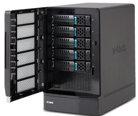
DNS-1200-05 ShareCenter Pro Unified Network Storage

High-Performance SAN – SAN (Storage Area Network) arrays offer tremendous power for large networks. A SAN is a dedicated storage network that puts the data stored on a variety of devices—including disk arrays and optical libraries—within the reach of various servers. However, high performance is typically only available at premium costs. Entry level solutions are easily upwards of $20K. Over the course of the last decade, SAN technology has become