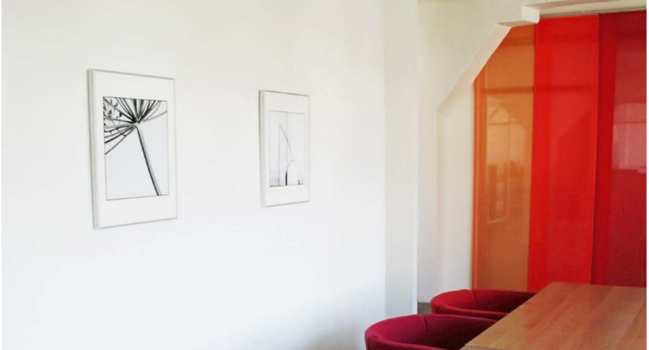
Black-and-white photography displayed with minimal reflections and UV protected by MIROGARD® Anti-Reflective Glass in a living room.