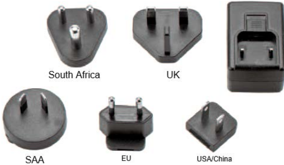
Size: 2.25in x 1.33in x 1.53in (57.2mm x 33.82mm x 38.86mm)