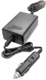
Size: 4.23in x 2.64in x 1.42in (107.5mm x 67mm x 36mm)