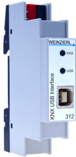
Photo of the device

Compact Interface between PC and KNX bus