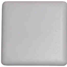
Fig. 1: KNX ENO 610