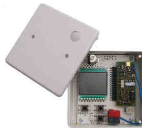
Fig. 3: KNX ENO 610

Select an installation location that lies within the range of the EnOcean sensors that will be used with the device. Avoid shielding objects (e.g. metal cabinets) and sources of interference (e.g. computers, electronic transformers, ballasts) near the gateway.