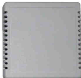
Fig. 2: KNX ENO 612