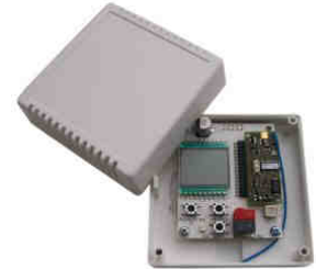
Fig. 4: KNX ENO 612

Detailed information on coverage planning and RF penetration can be found in the sensor data sheets.