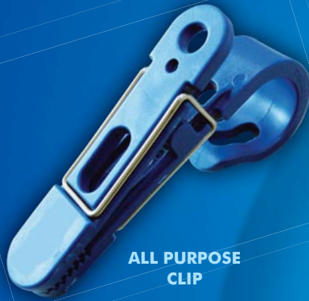
ALL PURPOSE CLIP