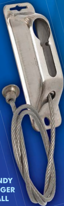
HANDY HANGER WALL