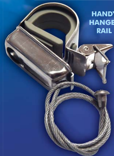
HANDY HANGER RAIL