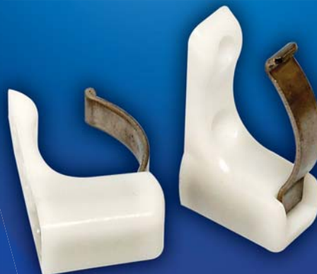
POLE HOLDER CLIP