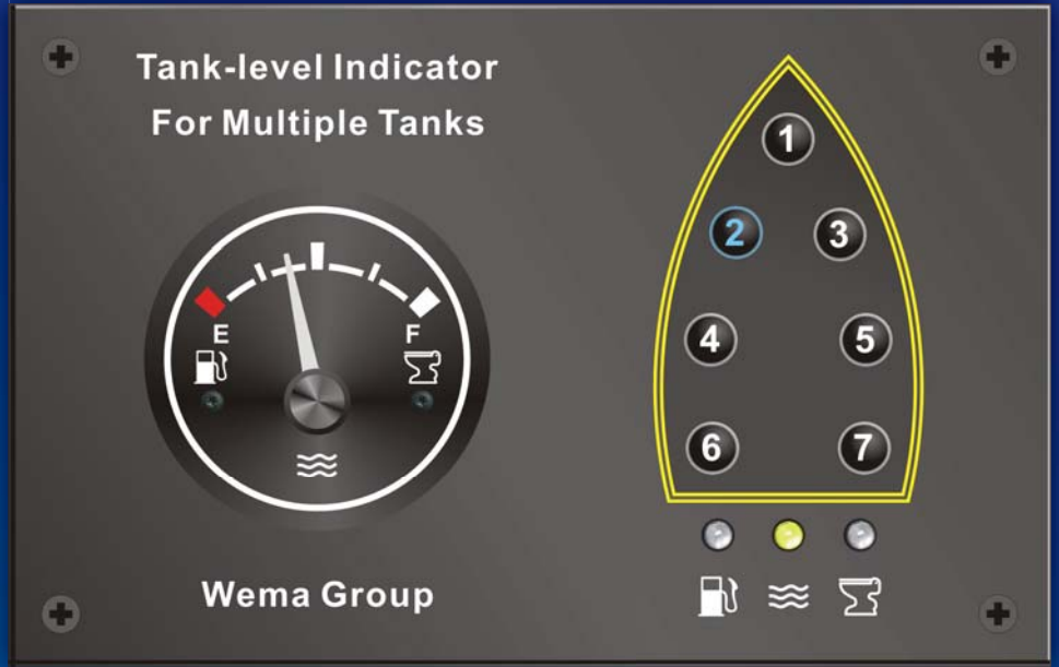
UP7-B | PROGRAMMABLE AND ALARMED