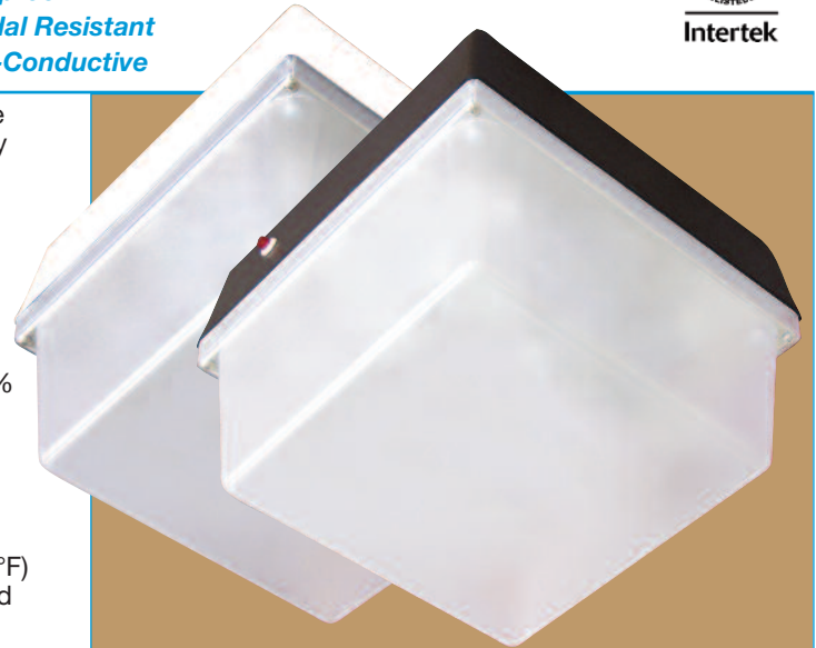
Non-Emergency and Emergency versions (shown with white and bronze housings, respectively) allow continuity of aesthetics in multiple luminaire installations.

LEDs: High Quality Lighting Grade LEDs 3,000-5,000K Color Temperature. Emergency Mode Lumens: 1,275 Watts: 50 Non-Emergency Mode Lumens: 4,000 Watts: 44 LED Lumen Maintenance = 96,000 hours (TM-21-11 70% Projection) Warranted for five (5) years.