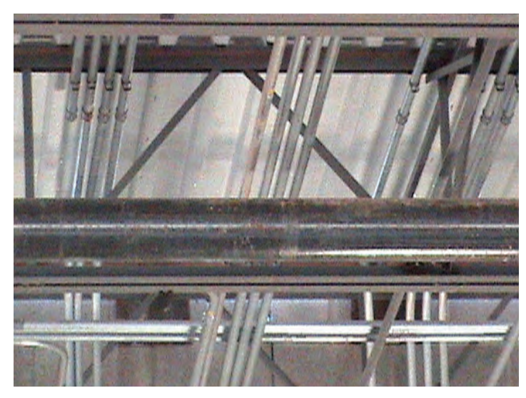
Baker Brother's realized a projected 20% savings in materials and installation costs on this large job for a mid-west "big box" retailer, and plans to start using 20' length EMT in many future jobs when applicable.