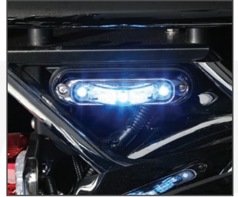
Surface Mount ION™ Under Radio Box Mount Kit for use with one lighthouse. Available in road side or curb side