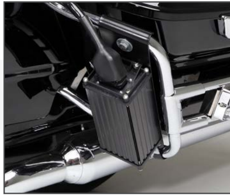
100 Watt Waterproof Siren Amplifier and Siren Mounting Bracket Kit