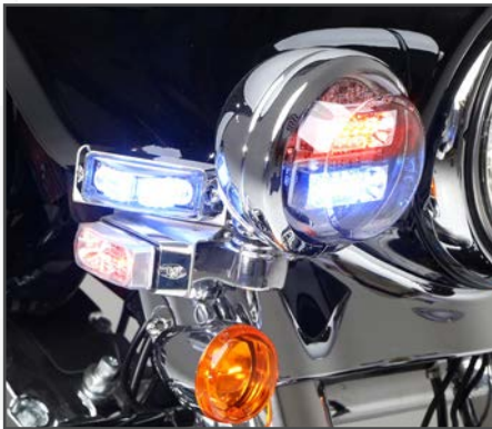
Front passing/fog lamp kit available in 90° or 90° and 45° models. Includes flange