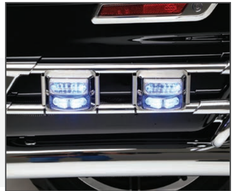
Side Mount Bracket for use with Harley-Davidson® OEM Saddlebag Wraps allow for easy mounting of two lighthouses. Includes flange