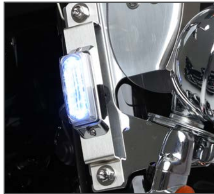
Side Fork Mounting Bracket Kit allows for easy mounting of one lighthouse. Includes flange