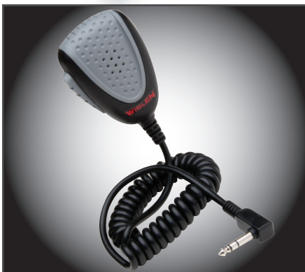
Noise Canceling Microphone