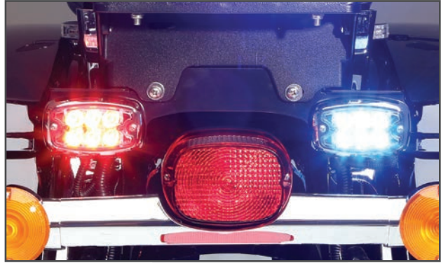
License Plate Bracket for horizontal mount of two lightheads M2KTHD1