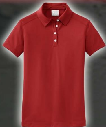
Nike Golf Ladies Dri-FIT Pebble Texture Polo Style 354064

3.9-ounce, 100% polyester Open hem sleeves and self-fabric collar Sizes: S-2XL