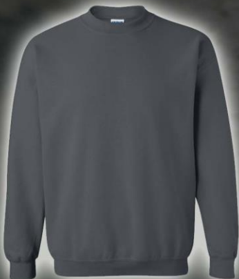
Gildan Heavy Blend Crewneck Sweatshirt Style 18000

8-ounce, 50/50 cotton/poly Pill resistant Sizes: S-5XL