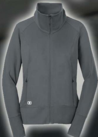
OGIO Endurance Ladies' Fulcrum Full-Zip Style LOE700

95/5 poly/spandex jersey Lower front invisible zippered pockets Sizes: XS-4XL