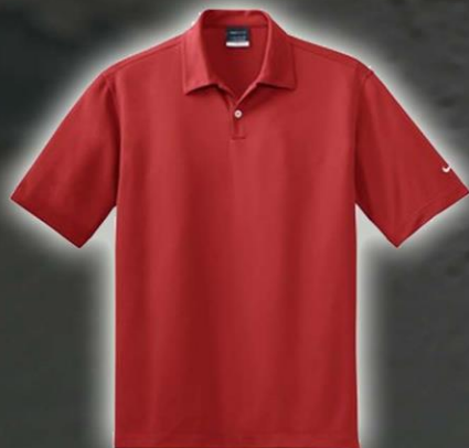
Nike Golf Dri-FIT Pebble Texture Polo Style 373749

3.9-ounce, 100% polyester Open hem sleeves and self-fabric collar Sizes: XS-4XL