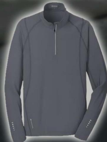
OGIO Endurance Nexus 1/4-Zip Pullover Style OE335

5.6-ounce, 88/12 poly/spandex jersey body Moisture wicking, odor control, zoned ventilation Sizes: S-4XL