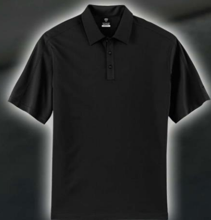
Nike Golf Tech Sport Dri-FIT Polo Style 266998

4-ounce, 100% polyester Open hem sleeves and self-fabric collar Sizes: XS-4XL