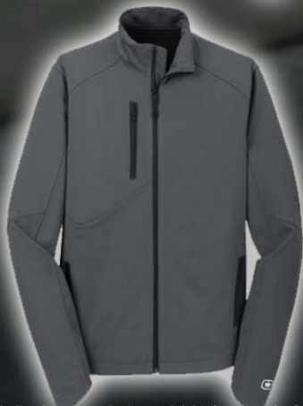
OGIO Endurance Crux Softshell Style OE720

100% poly stretch shell bonded to textured grid fleece with a laminated film insert for wind and water resistance Sizes: XS-4XL