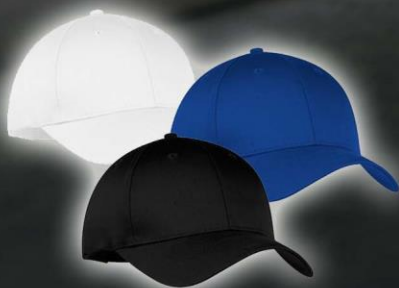
Port & Company Twill Cap Style CP80

100% Cotton twill Mid-profile structured Adjustable velcro closure