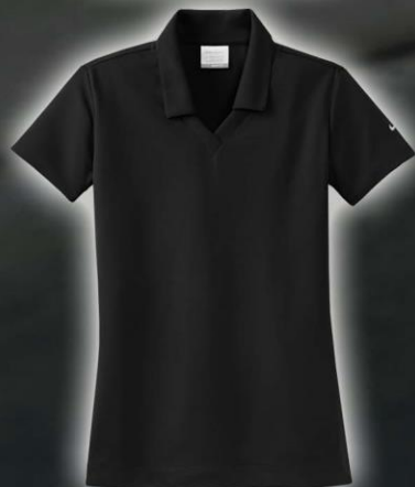
Nike Golf Ladies Dri-FIT Micro Pique Polo Style 354067

4-ounce, 100% polyester Open hem sleeves and Johnny collar Sizes: S-2XL