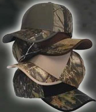
Kafi Solid Front Camouflage Cap Style LC102

60/40 brushed cotton twill/polyester 100% Cotton bio-washed twill, mesh sides and back Mid-profile structured Slide buckle closure