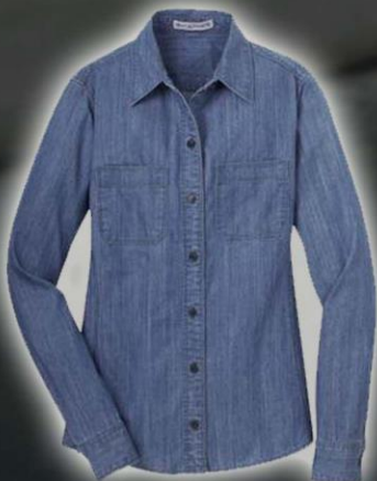
Port Authority Ladies' Patch Pocket Denim Shirt Style L652

6.2-ounce, 100% cotton Gently contoured silhouette Sizes: XS-4XL