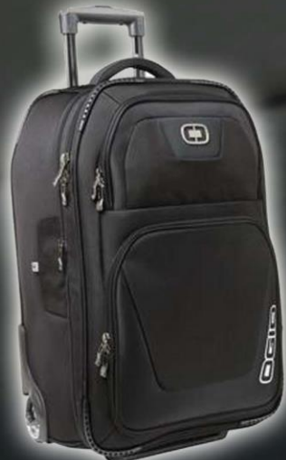
OGIO Kickstart 22 Style 413007

1,680D poly/900D poly Fully lined interior In-line skate wheels Locking retractable handle Garment compression straps Strong, durable grip handle on foot 22"h x 14"w x 10"d (expanded)