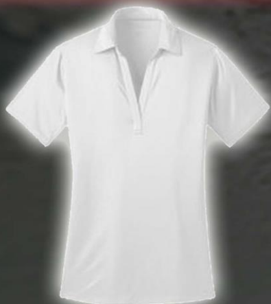
Port Authority Ladies' Silk Touch Performance Polo Style L540

3.9-ounce, 100% cationic polyester double knit Open hem sleeves and V-neck Johnny collar Sizes: XS-4XL