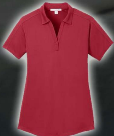
Port Authority Ladies Diamond Jacquard Polo Style L569

5-ounce, 100% polyester Self-fabric collar Sizes: S-2XL