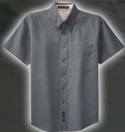
Port Authority Short Sleeve Easy Care Shirt Style S508

4.5-ounce, 55/45 cotton/poly Box back pleat Sizes: S-6XL