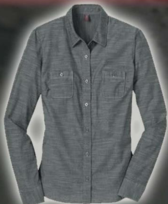
District Made Ladies Long Sleeve Washed Woven Shirt Style DM4800

3-ounce, 100% ring spun combed cotton slub chambray Sizes: XS-4XL