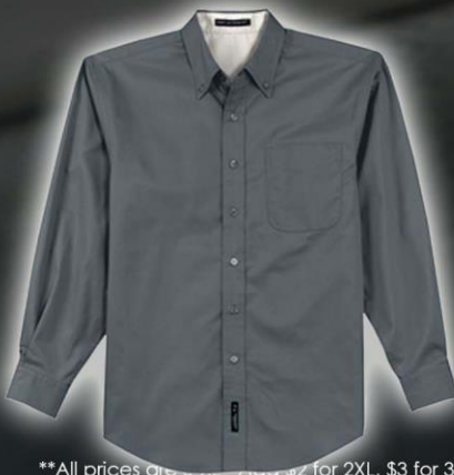
Port Authority Long Sleeve Easy Care Shirt Style S608

4.5-ounce, 55/45 cotton/poly Box back pleat Sizes: S-6XL