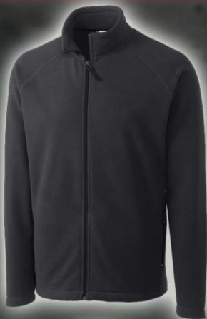
Clique by Cutter and Buck Summit Full Zip Microfleece Style MQO00028

5.9-ounce, 100% polyester Two front zipper pockets Sizes: S-5XL