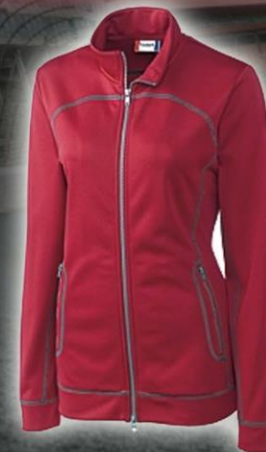
Clique by Cutter and Buck Ladies' Ladies Helsa Style LQK00030

6.8-ounce, 100% bonded polyester fleece Full zip with mock neck Sizes: XS-3XL