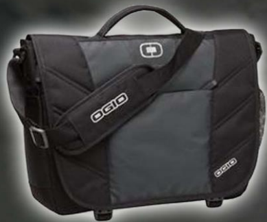
OGIO Upton Messenger Style 417015

600D poly/420D dobby poly Interior padded laptop compartment 13.25"h x 17.5"w x 4.5"d