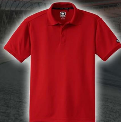
OGIO Framework Style OG125

4.2-ounce, 100% poly pique with stay-cool wicking and odor control technologies Sizes: XS-4XL