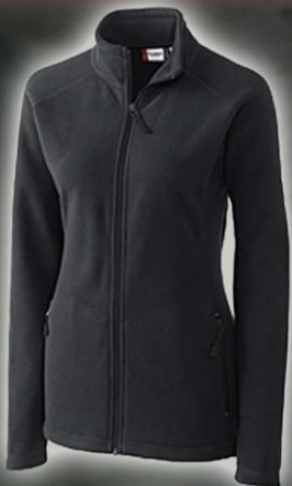
Clique by Cutter and Buck Ladies' Summit Full Zip Microfleece Style LQO00019

5.9-ounce, 100% polyester Two front zipper pockets Sizes: S-5XL