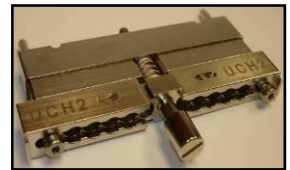
UCH2 – RF Switch Card