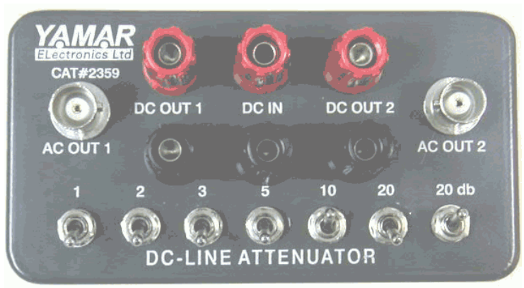
Figure 1 - The DC-Line Attenuator

The attenuator has two BNC connectors to output the AC signals in both sides of the attenuator.