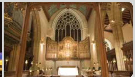
Houses of Worship