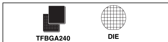
Table 1. Order Codes