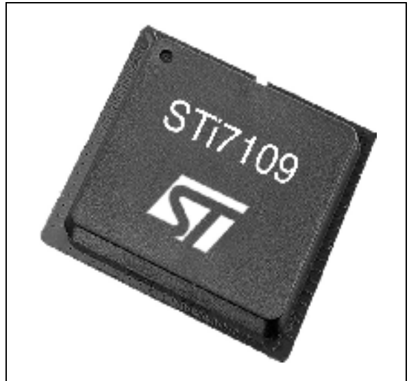
Figure 1. H.264/AVC low-bit rate set-top box decoder