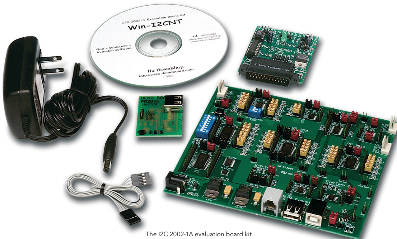
The I2C 2002-1A evaluation board kit

Purchase either board at www.digikey.com or www.demoboard.com .