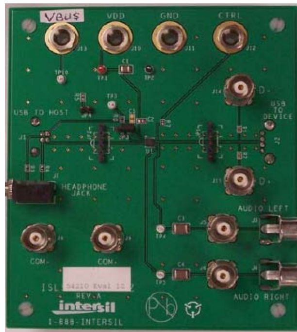
FIGURE 1. ISL54210EVAL1Z EVALUATION BOARD