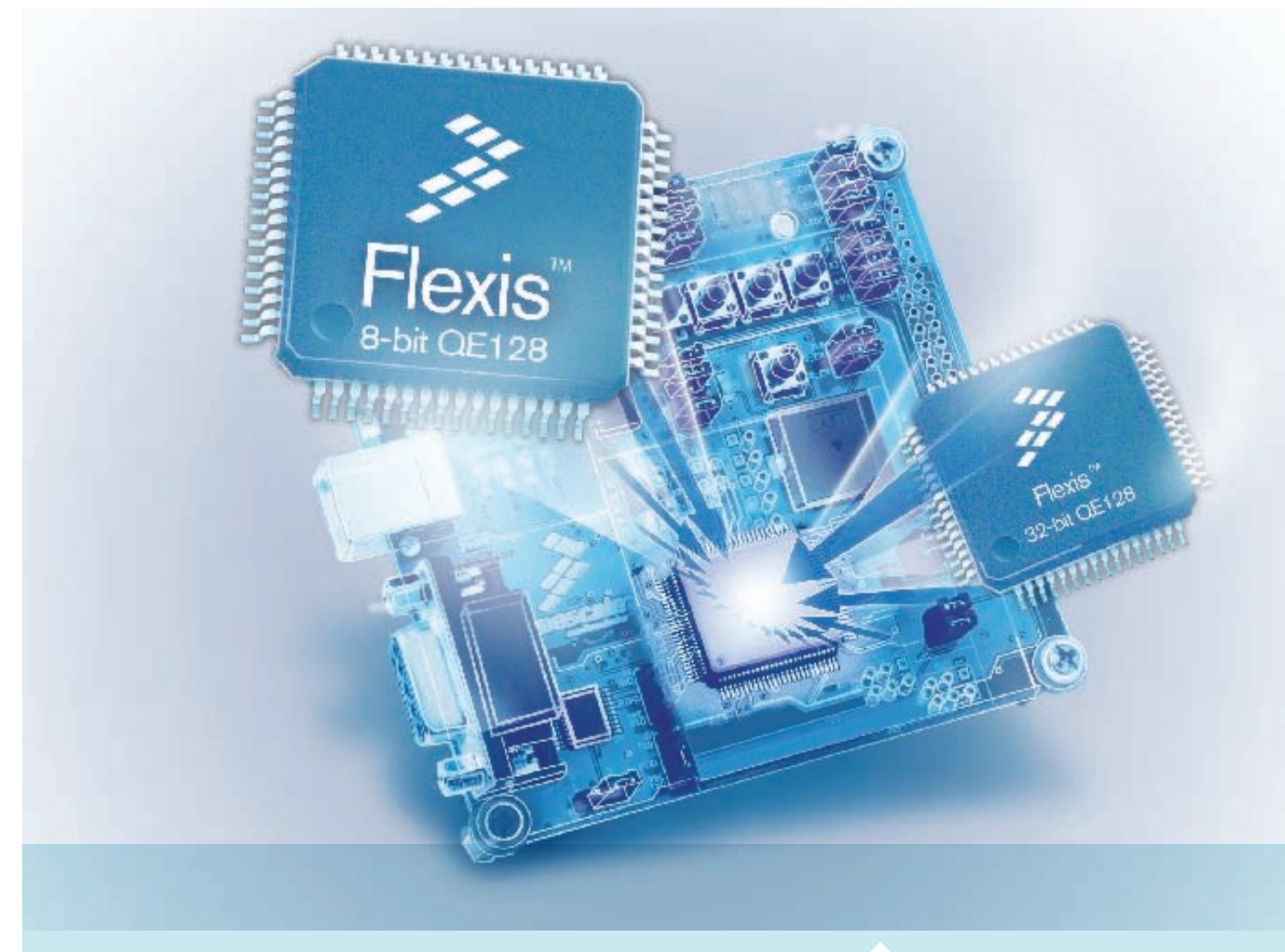
Flexis™ Series—8-bit and 32-bit Compatible MCUs