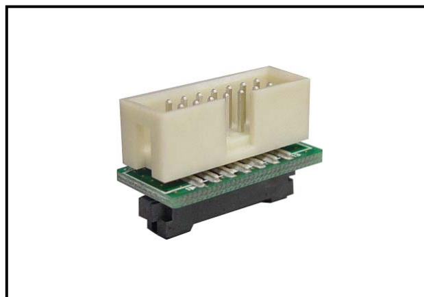
Figure 1 External View of the R0E000010CKZ00

The R0E000010CKZ00 allows connection of the E1 to a user system on which the only mounted connector is for the E20. However, the only available functions are those of the E1. Functions specific to the E20 are not available.