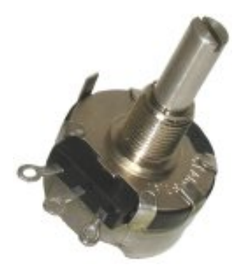
Representative photograph, actual product appearance may vary.

Due to regional agency approval requirements, some products may not be available in your area. Please contact your regional Honeywell office regarding your product of choice.