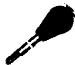
Universal Handle Part No. 465629-□ 1

Requires Installation Tip: Part Number 465468-1 (≤ .185 [4.7] insul. dia. and/or crimp width) or Part No. 465488-1 (> .185 [4.7] insul. dia. and/or crimp width).