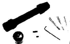
Insertion/Extraction Tool Part No. 91285-1