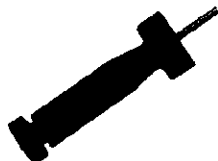
Extraction Tool Part No. 455822-2