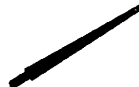
Extraction/Lance Reset Tool Part No. 843996-3