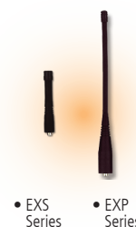
• EXS Series • EXP Series