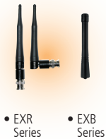
• EXR Series • EXB Series