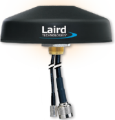
• Dual-band & Tri-band GPS AVL