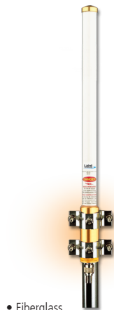
• Fiberglass Omnidirectional