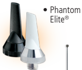
• Phantom Elite®