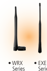
• WRX Series • EXE Series