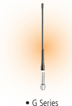
• G Series