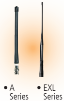
• A Series • EXL Series