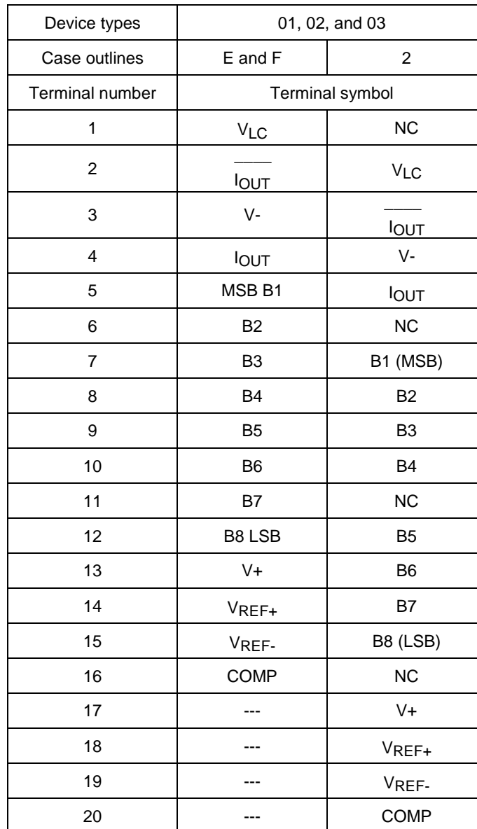
FIGURE 1. Terminal connections.