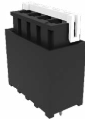
L1NK 396 Connector

Reducing labor costs, saving time and resources