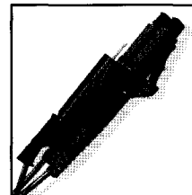
AMPTRAC LC Cable Assembly

X denotes length in meters: -1 = 1, -2 = 2, -3 = 3, -5 = 5, -7 = 7, 1--0 = 10 NOTE: Contact Tyco Electronics concerning potential ST connector solutions.