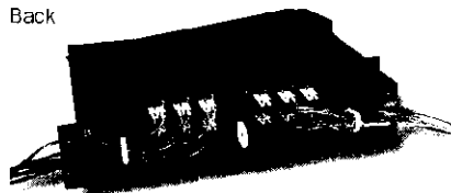
2U, Shown loaded with 6-fiber duplex SC adaptor plates (not included)