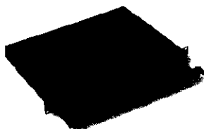
Rack Mount Enclosure Holds up to 4 six-port modular jack modules, up to 3 snap-in 1435040-1 adapter plates or 3 fiber cassettes