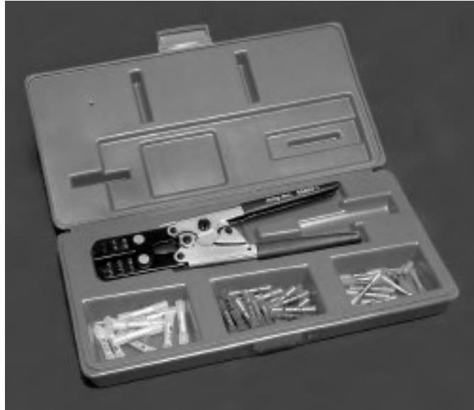
Kit No. 55892-1