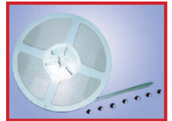
Chip NTC Thermistors

Supplying high-quality bimetal and thermal sensor products.