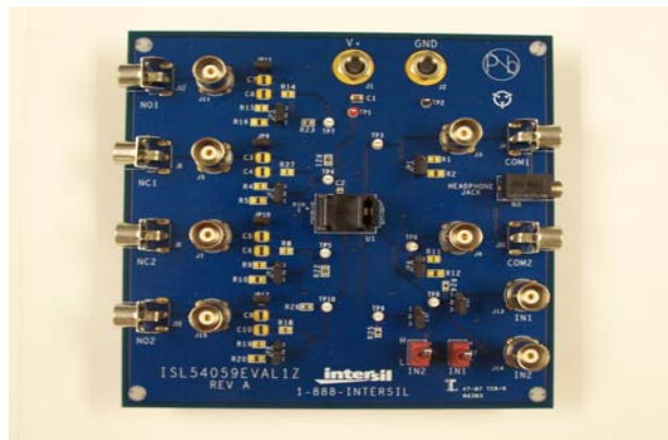
FIGURE 1. ISL54059EVAL1Z THROUGH ISL54064EVAL1Z EVALUATION BOARD