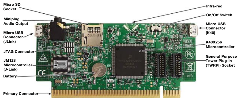
Figure 2: Back Side of KwikStik Development Board