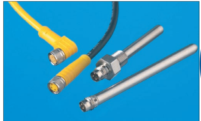
Industrial Grade Temperature Sensors

SS&C types TS and TX are ruggedized probes that seal the sensing element from the outside environment. Because they include industry standard cordsets and connectors they are extremely easy to use. The sealed end design adds an extra level of moisture resistance over previous designs. These products simplify the installation and connection of temperature sensors in the harshest applications where the protection of the sensing element from the environment is critical. With this new design, it is now possible to have a fully enclosed sensor that will provide a lifetime of accurate and reliable sensing. Please contact the factory for specific design or application information or the availability of options.