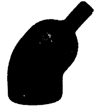
AFTER UNRESTRICTED RECOVERY