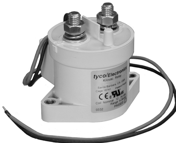
EV200 Series Contactor (CZONKA® Relay, Type III)

Typical EV200 applications include battery switching and back-up, DC voltage power control, circuit protection and safety.