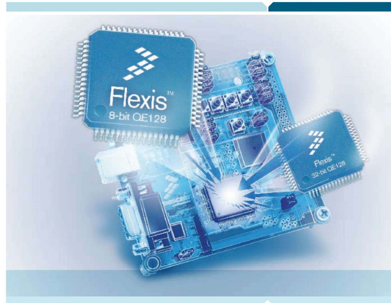
Flexis™ Series—8-bit and 32-bit Compatible MCUs