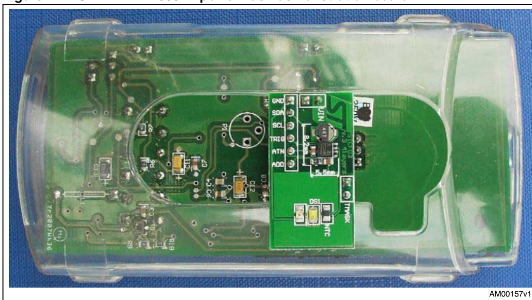
Figure 1. STEVAL-TLL005V1 power flash demonstration board

The STEVAL-TLL005V1 consists of both a motherboard and a daughterboard connected together (STEVAL-TLL004V1 for the daughterboard only).