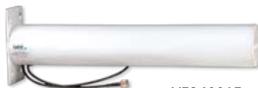
YE240015 Enclosed Yagi