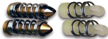
Push Pin Spring Kits