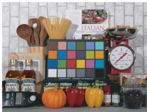
CMOS Image Sensor SOC Output (Post signal-processing image)