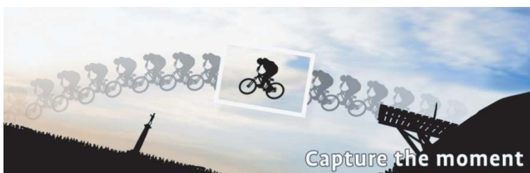
Figure 3 Graphic Showing the Scalado "SpeedTags" Technology Output