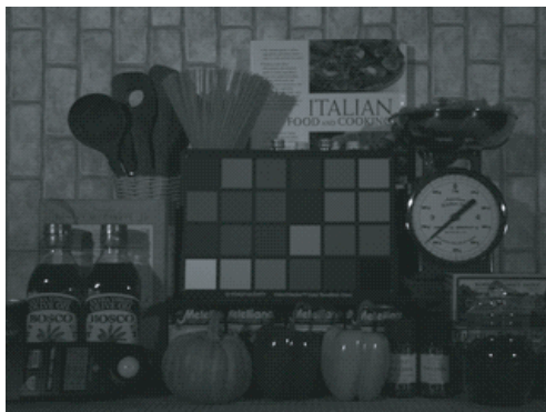
CMOS Image Sensor Output (Raw image)